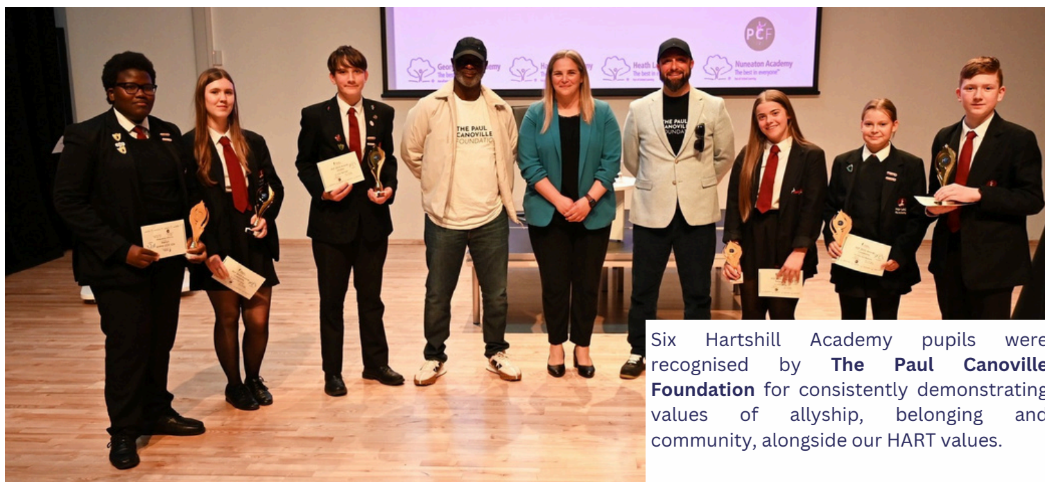
League of their own: Winning pupils display their certificate and trophies awarded by The Paul Canoville Foundation for exemplifying excellent character values

Six Hartshill Academy pupils were recognised by The Paul Canoville Foundation for consistently demonstrating values of allyship, belonging and community, alongside our HART values.