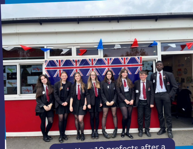
Our Year 10 prefects after a busy morning of serving at the VE Day 80 celebrations